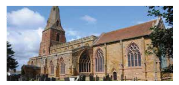
The audience of 200 was made up of OLs, their families and parishioners of St Margaret's who had supported the School's Crick concerts over the years.

There was a collection which enabled the OLs to donate \pounds1200 to Cancer Research UK and \pounds500 to St Margaret's Church.