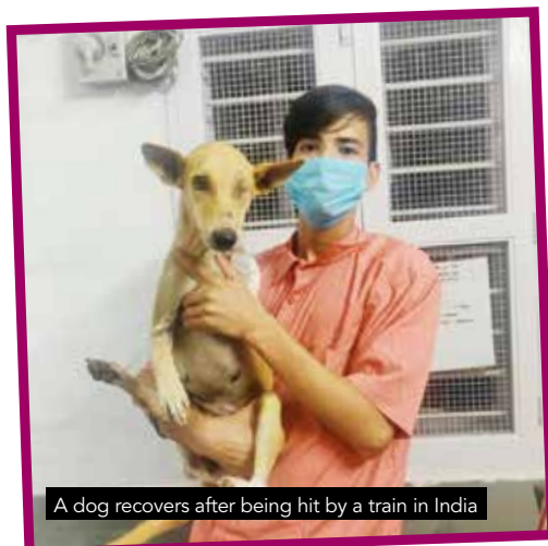
A dog recovers after being hit by a train in India

Follow us on Facebook: @Compassionatepawsinternational and Instagram: @compassionate.paws www.compassionatepaws.org